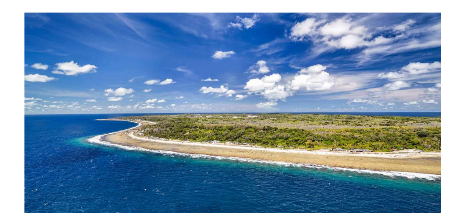
Nauru Economic and Climate Resilience Citizenship Program

A Nauruan passport provides visa-free or visa-on-arrival access to 89 destinations, including strategic financial hubs such as Hong Kong (SAR China), Ireland, Singapore, and the UK. This global mobility, combined with Nauru's commitment to sustainability and economic growth, makes it an attractive option for investors seeking both personal benefits and the opportunity to make a positive impact.