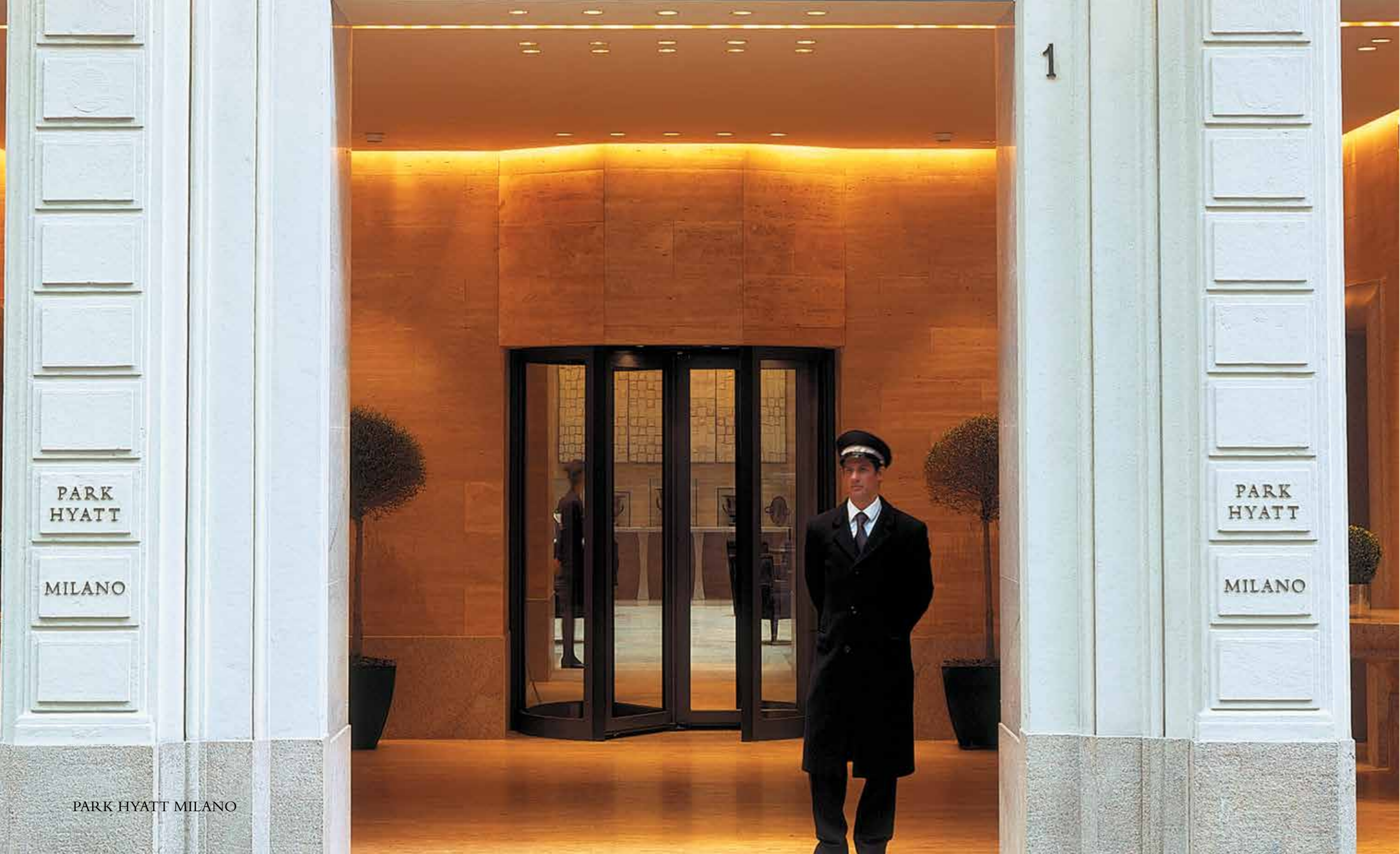
PARK HYATT MILANO