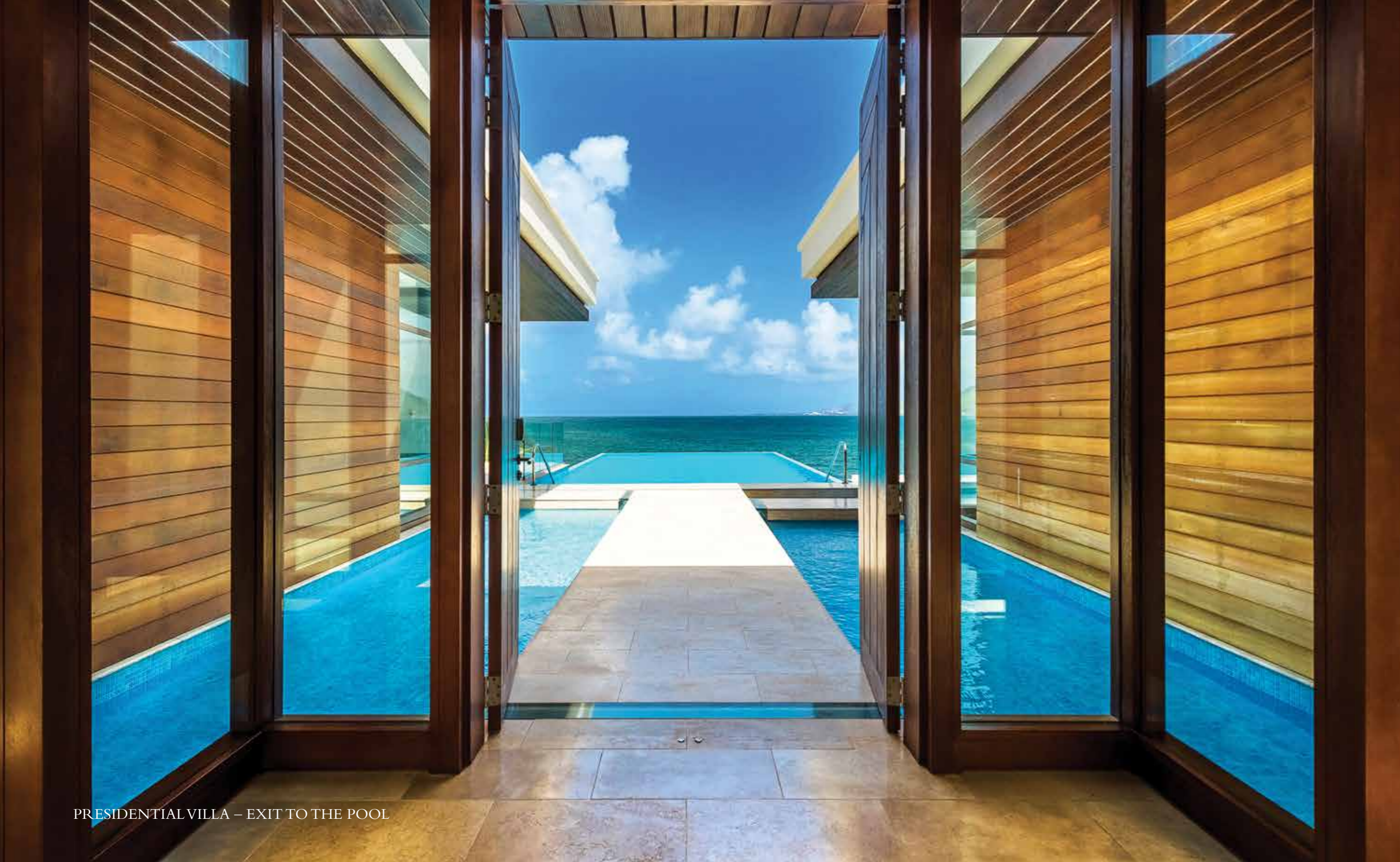
PRESIDENTIAL VILLA – EXIT TO THE POOL