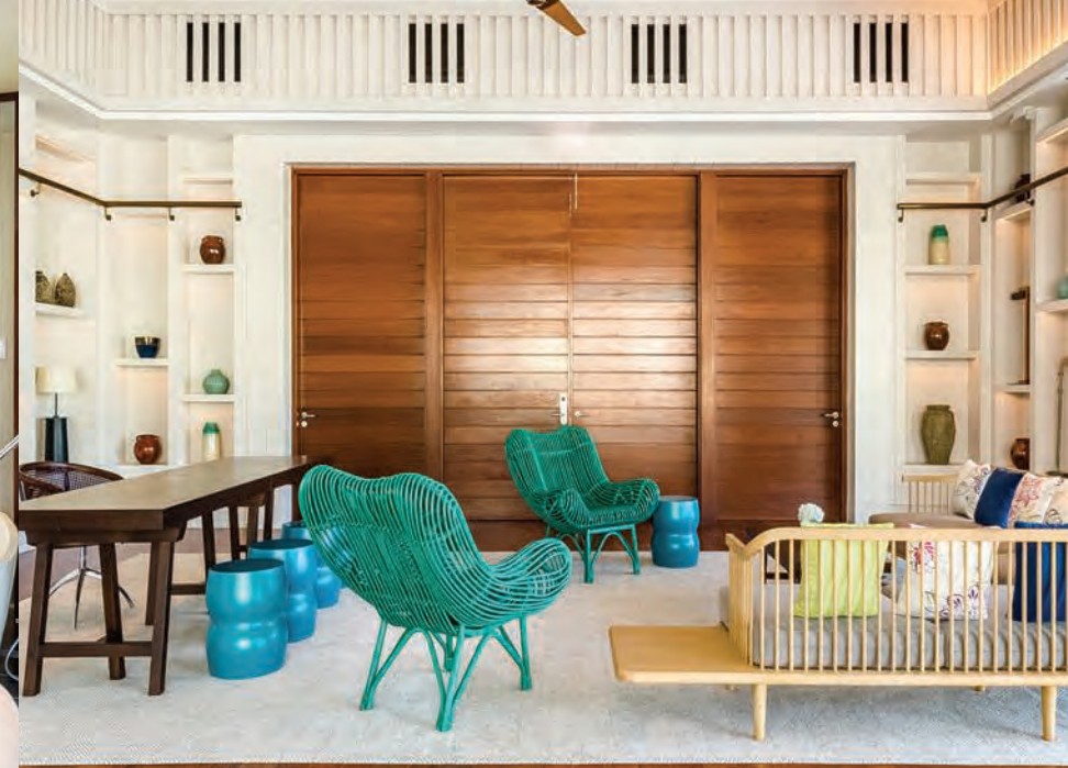
Reception, Park Hyatt St. Kitts