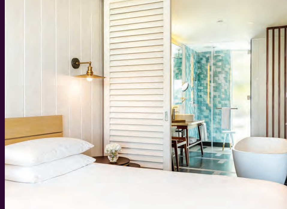
Luxury Bedroom, Park Hyatt St. Kitts