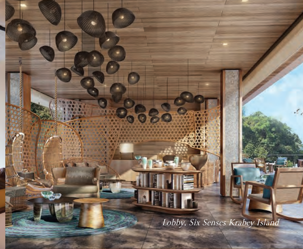
Lobby, Six Senses Krabey Island