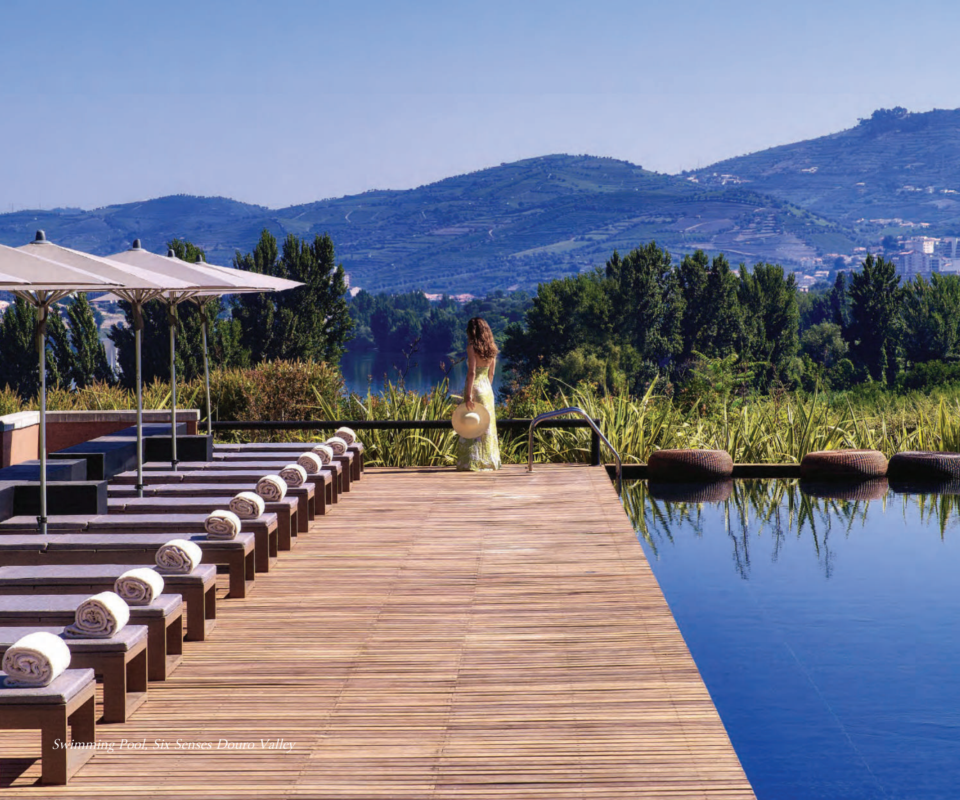
Swimming Pool, Six Senses Douro Valley