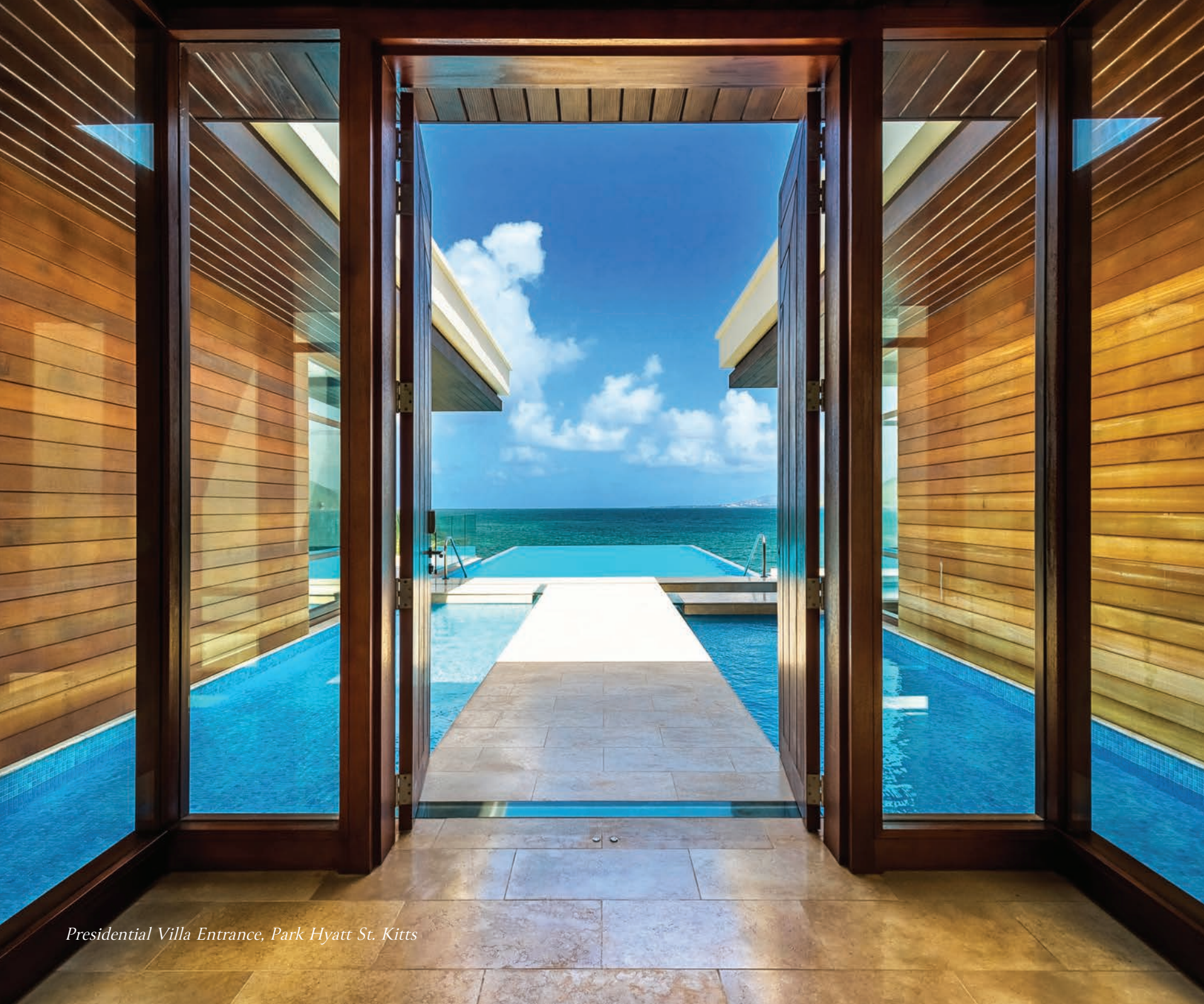
Presidential Villa Entrance, Park Hyatt St. Kitts