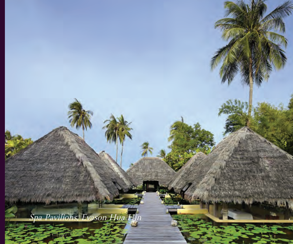
Spa Pavilions, Evason Hua Hin