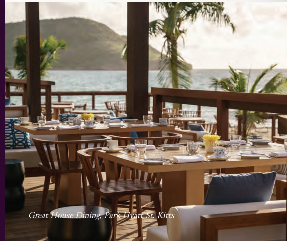
Great House Dining, Park Hyatt St. Kitts