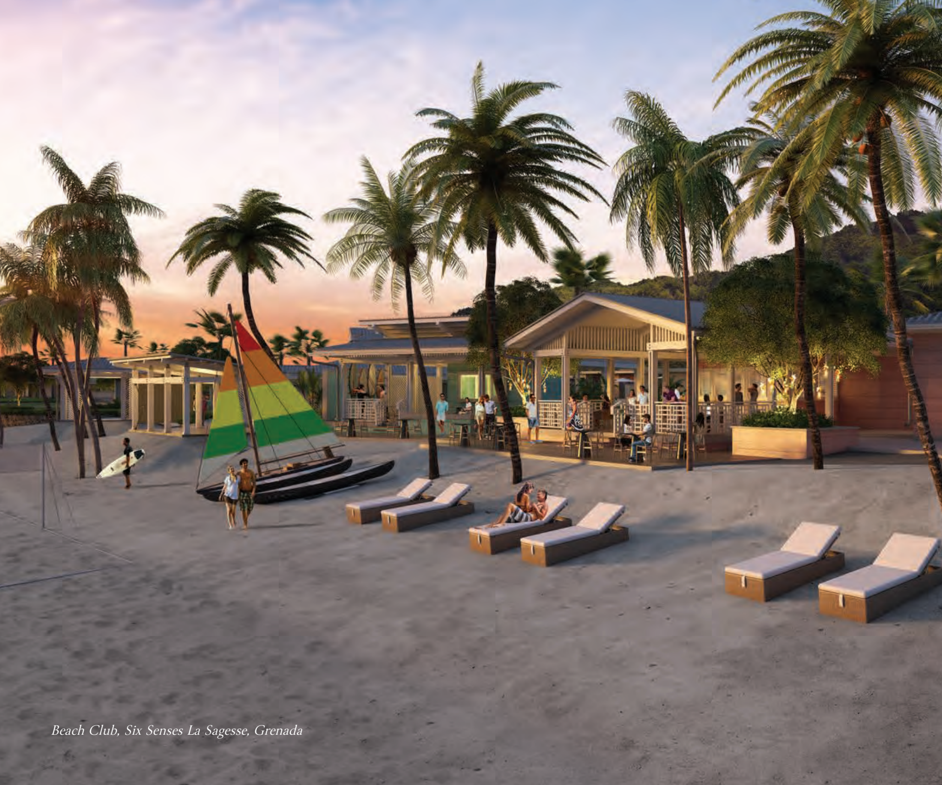
Beach Club, Six Senses La Sagesse, Grenada