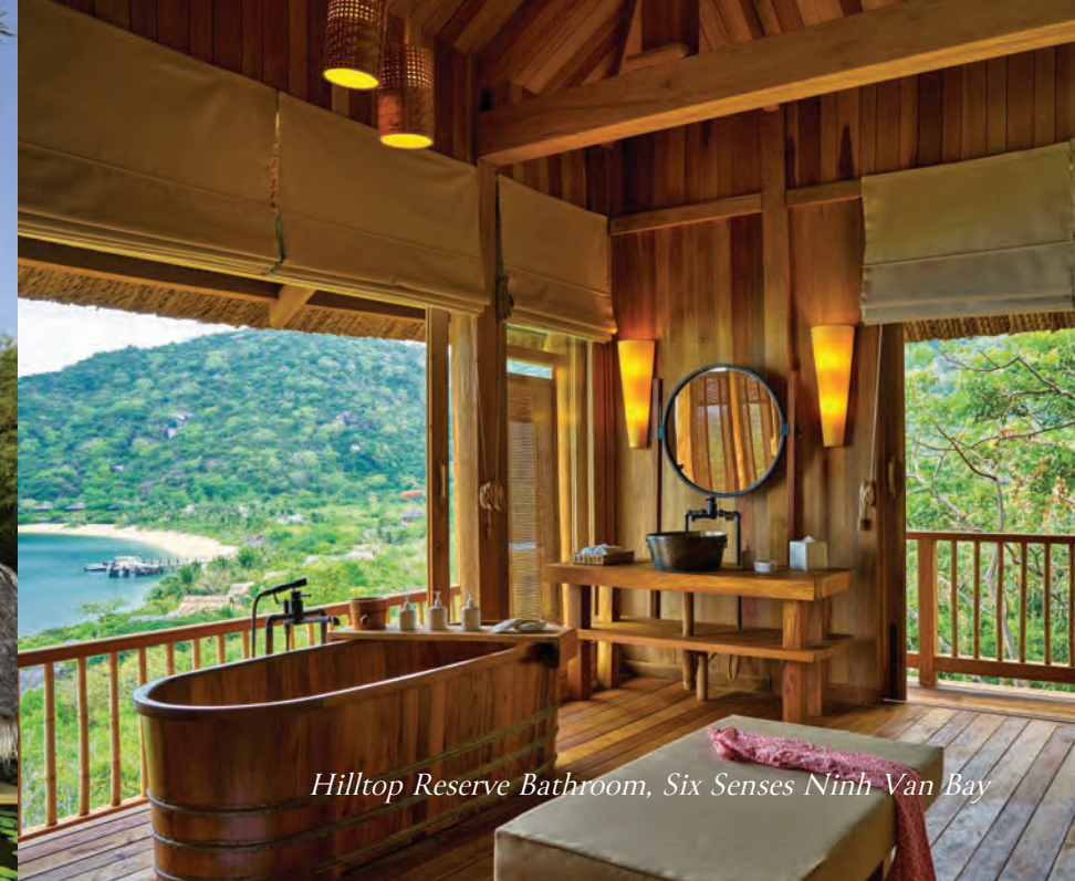
Hilltop Reserve Bathroom, Six Senses Ninh Van Bay