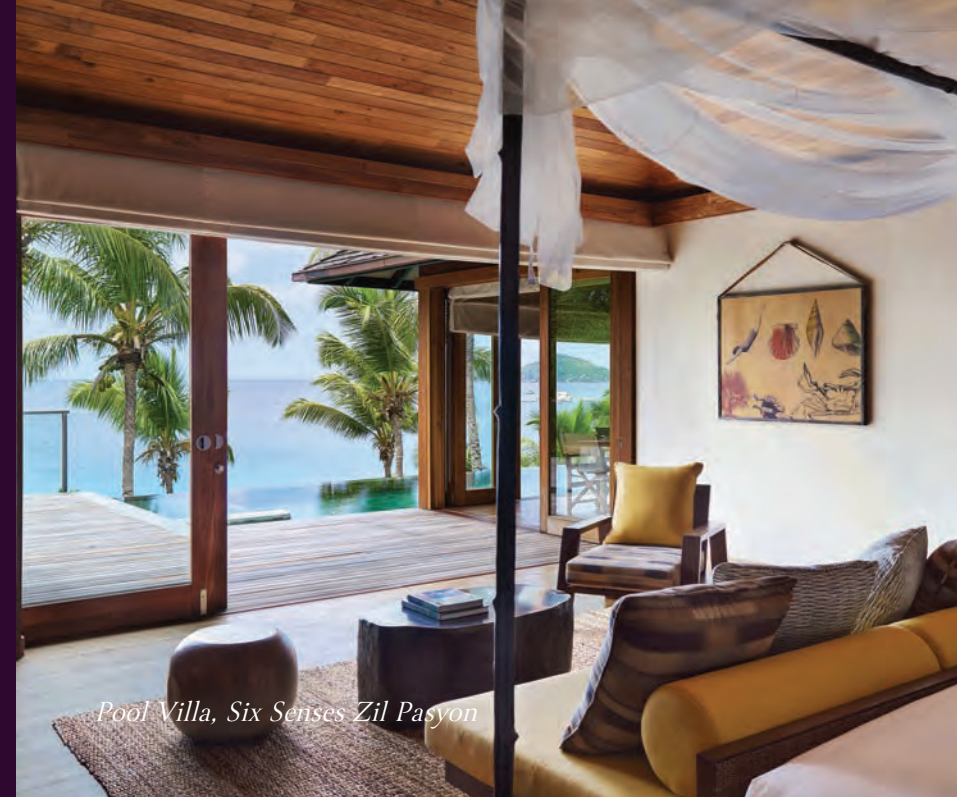
Pool Villa, Six Senses Zil Pasyon