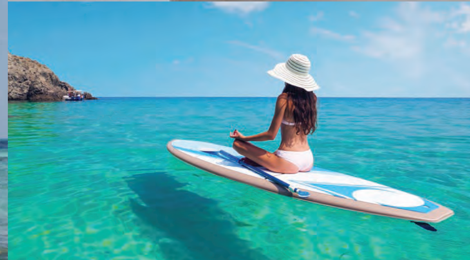
Ocean Front Villa, Six Senses Con Dao

All of the suites on the property will feature private plunge pools and sea views. Their design combines environmental ethos and contemporary comfort, with sustainable and repurposed materials and amenities. Bringing together impeccable style and service, Six Senses La Sagesse, Grenada will offer a lodging experience unmatched in the region.