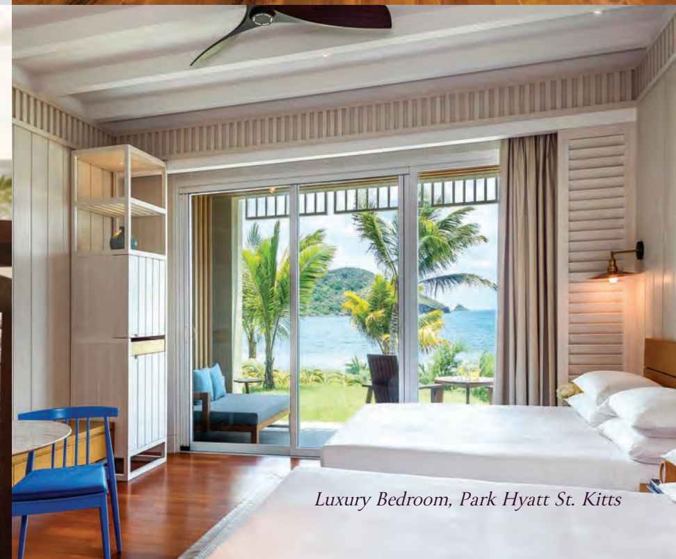
Luxury Bedroom, Park Hyatt St. Kitts