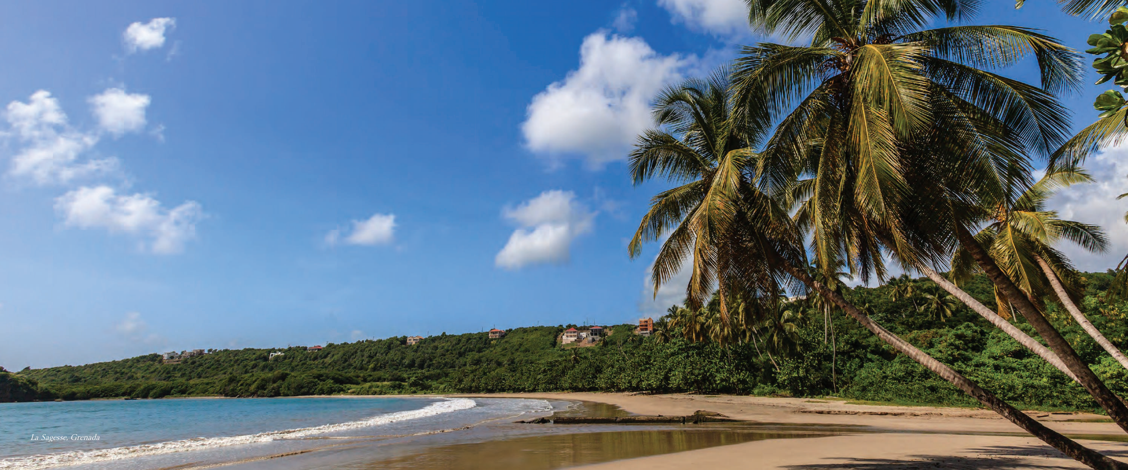
La Sagesse, Grenada