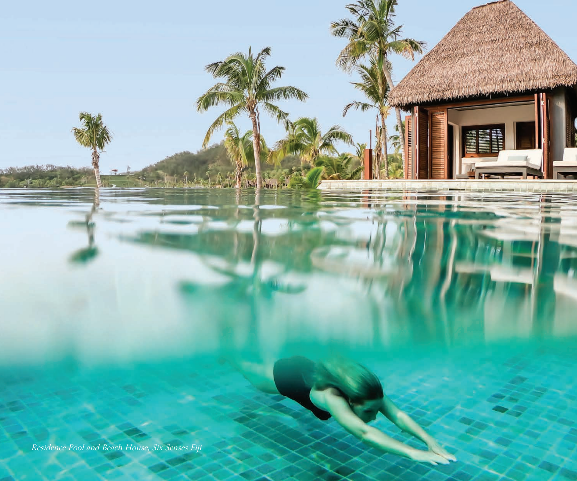
Residence Pool and Beach House, Six Senses Fiji