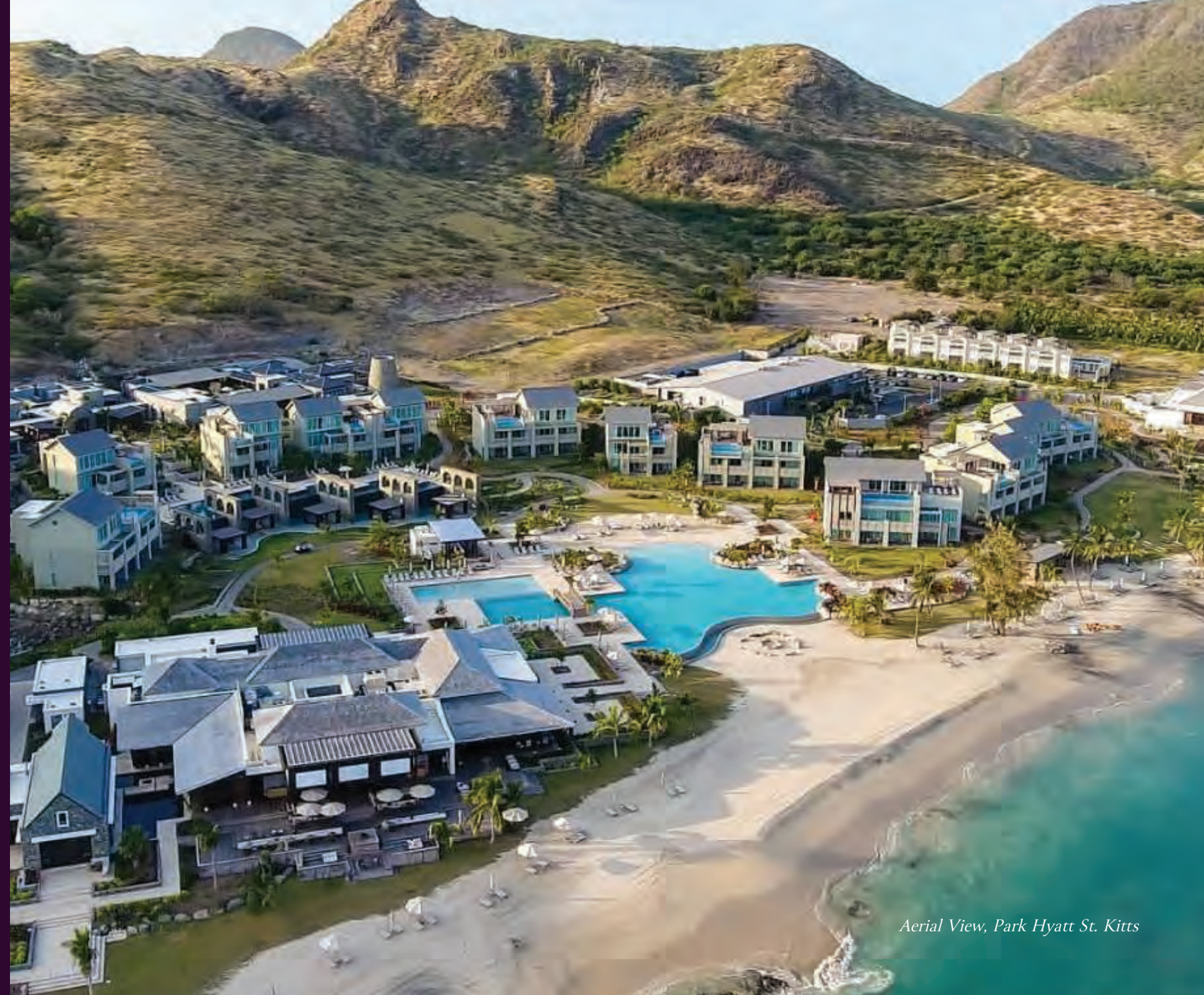
Aerial View, Park Hyatt St. Kitts