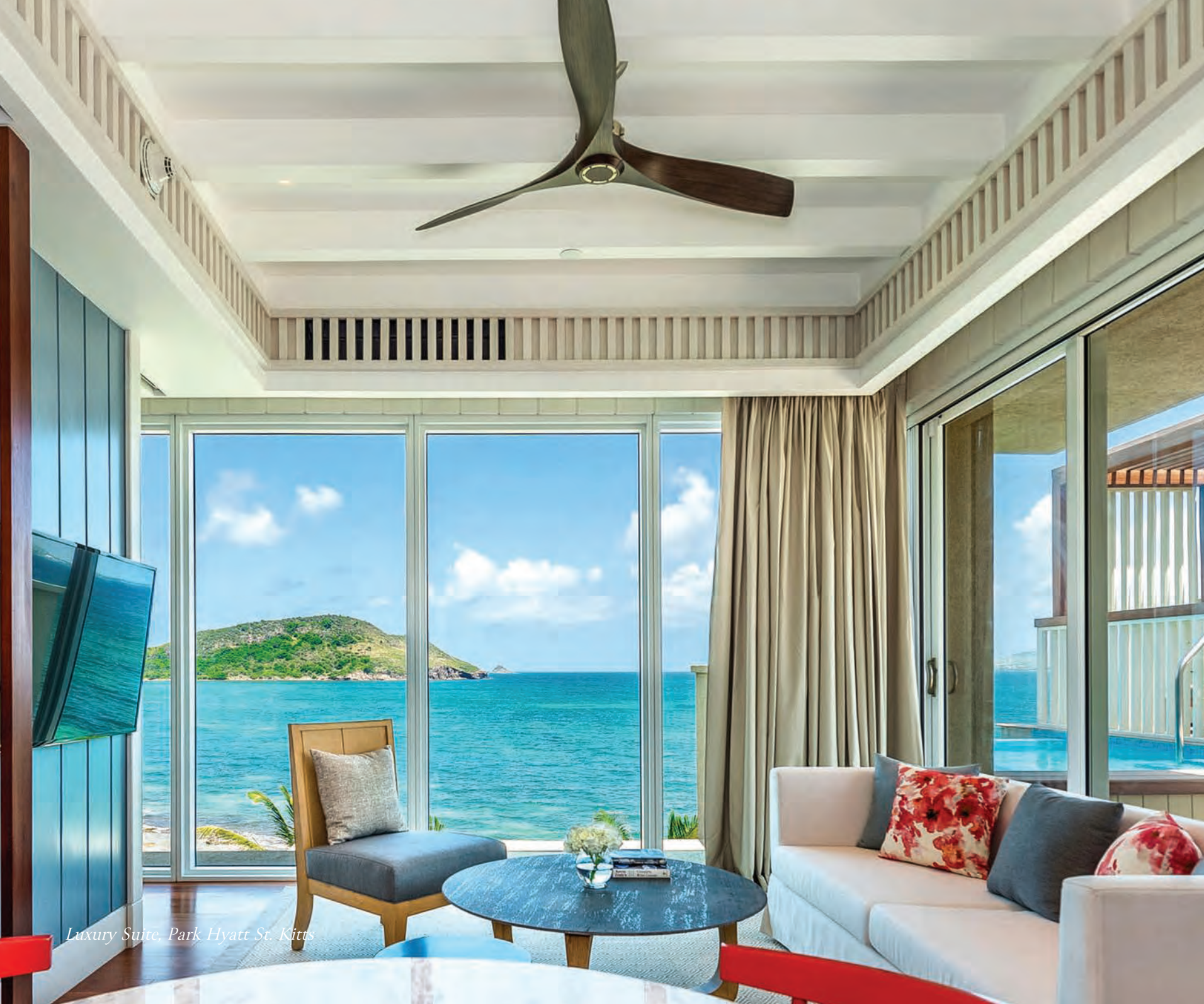
Luxury Suite, Park Hyatt St. Kitts

WE AIM TO ENHANCE THE LIVES OF OUR INVESTORS, OUR PARTNERS, AND OUR CLIENTS