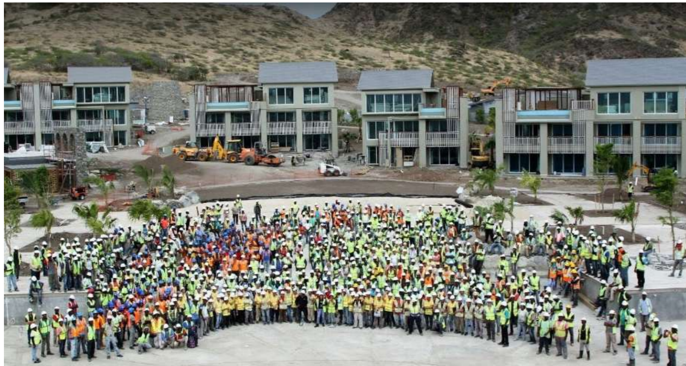
Top: Park Hyatt, St Kitts, St Kitts & Nevis | Developed by Range Developments Bottom: Range Developments | Construction Team