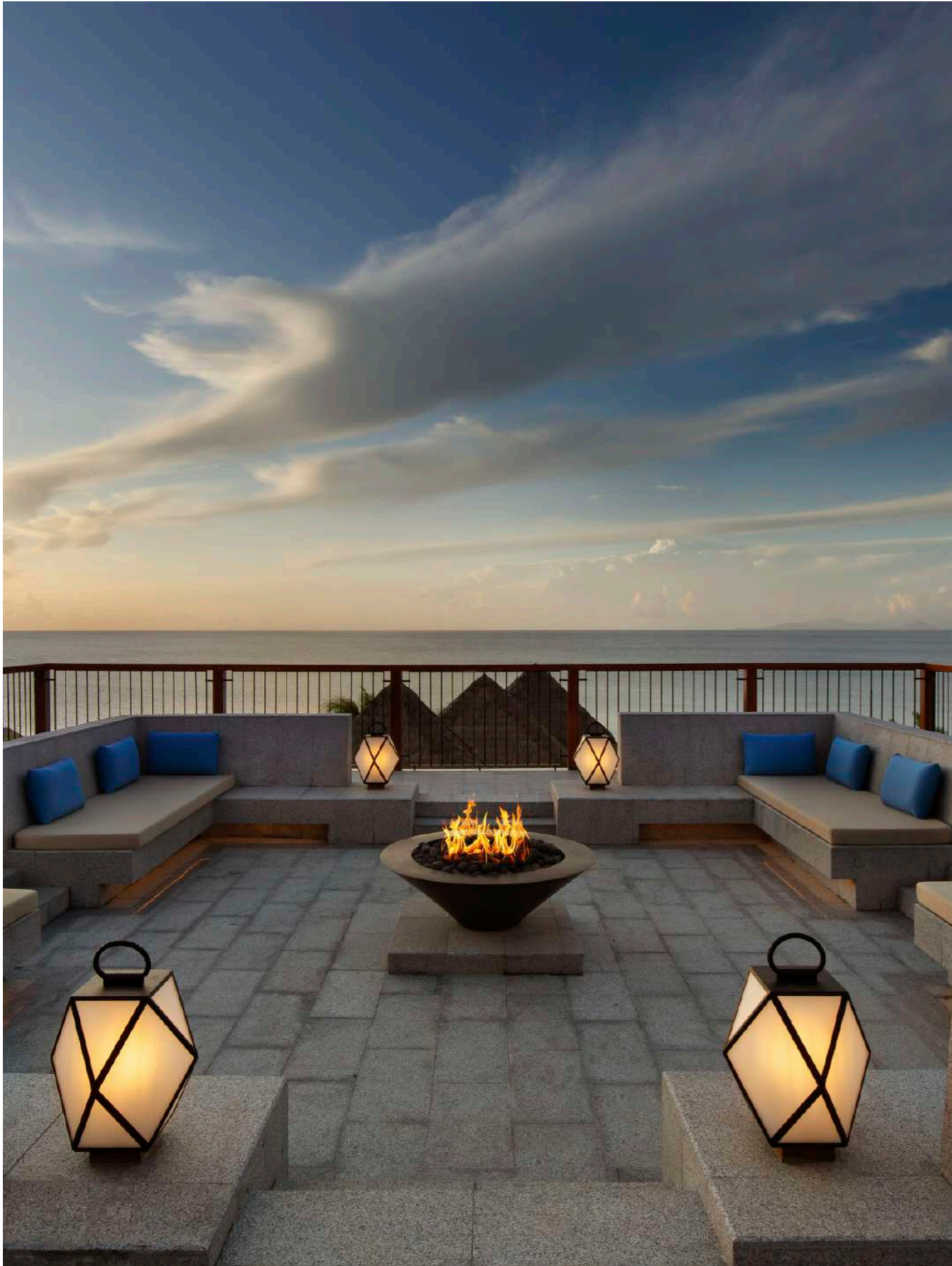
Cabrits Resort &amp; Spa Kempinski, Dominica | Developed by Ranged Developments