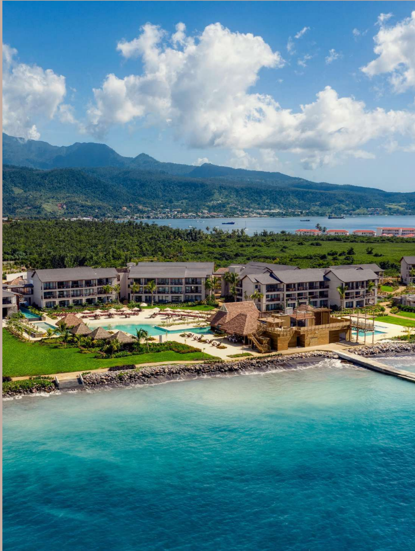
Cabrits Resort &amp; Spa Kempinski, Dominica | Developed by Ranged Developments