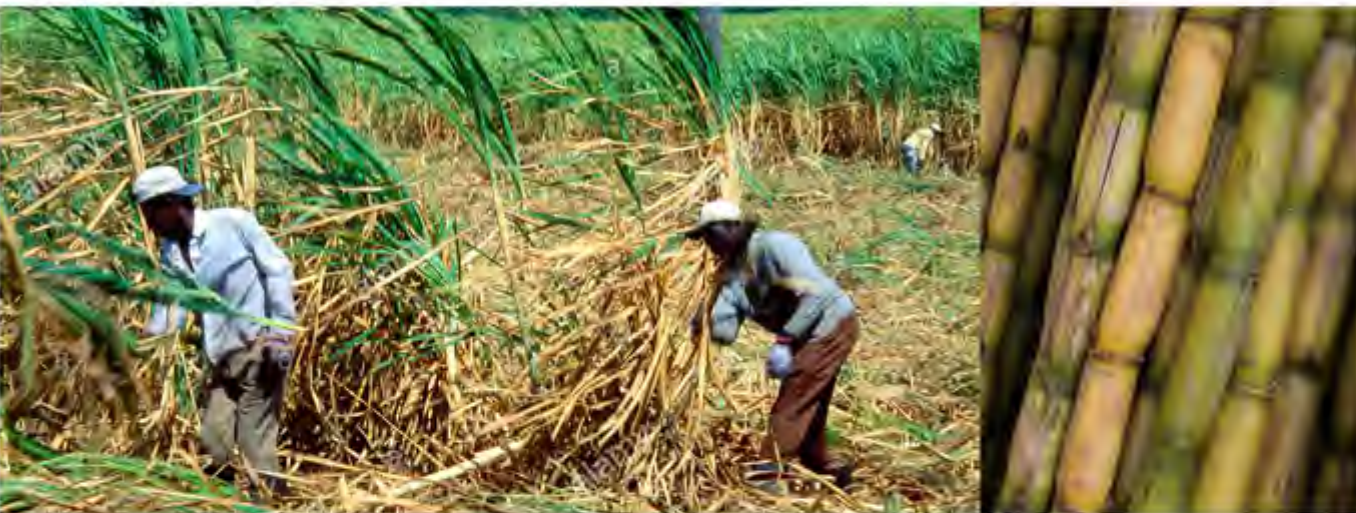
(LEFT) ALL IN A DAY'S WORK. Sugar cane farmers harvesting cane on a plantation