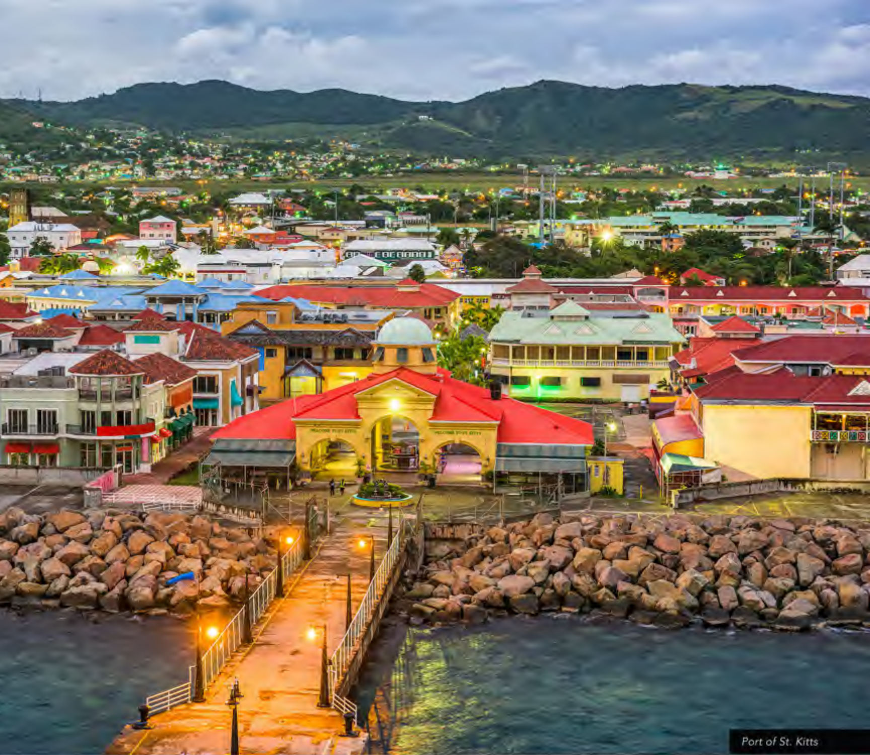
Port of St. Kitts