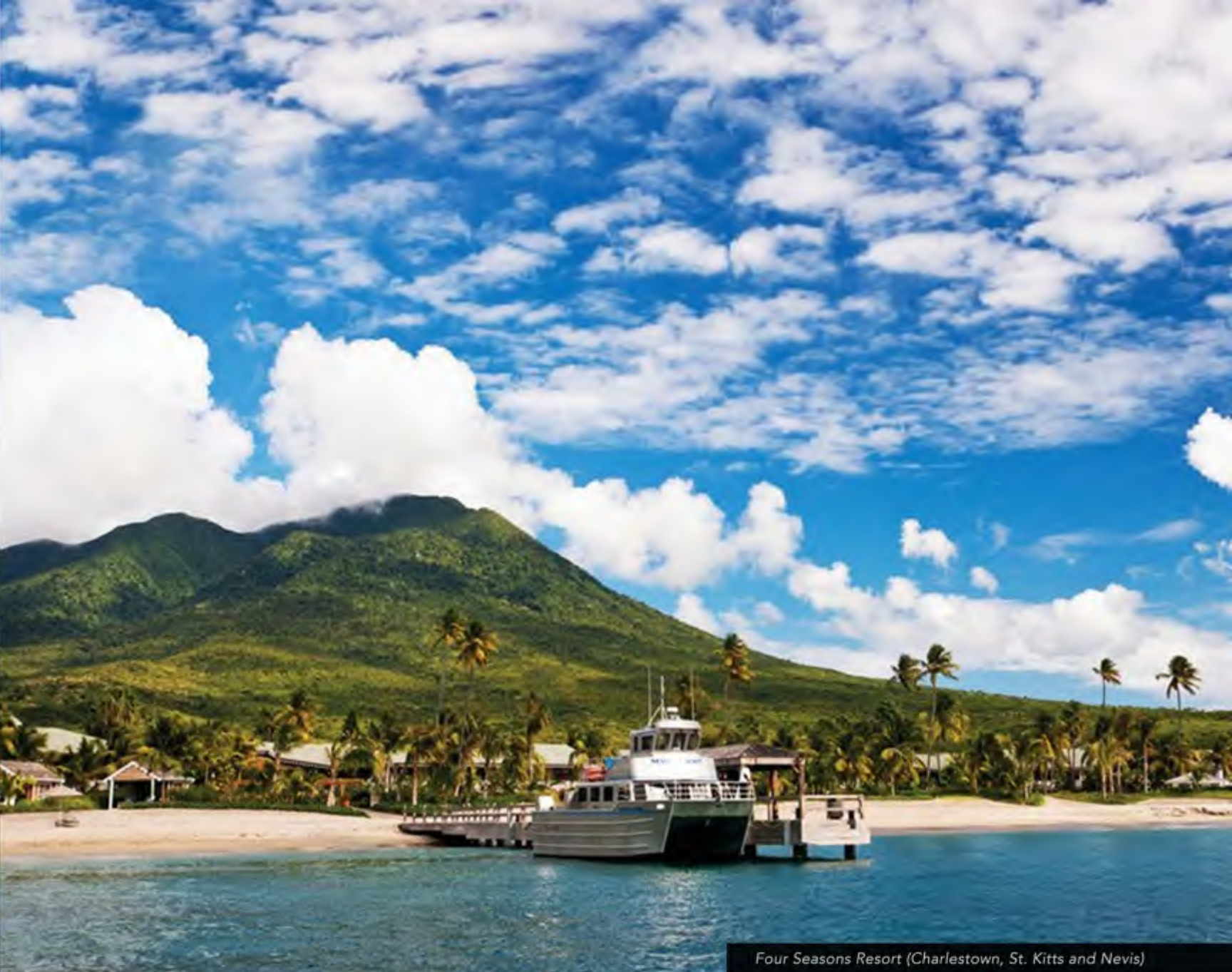
Four Seasons Resort (Charlestown, St. Kitts and Nevis)