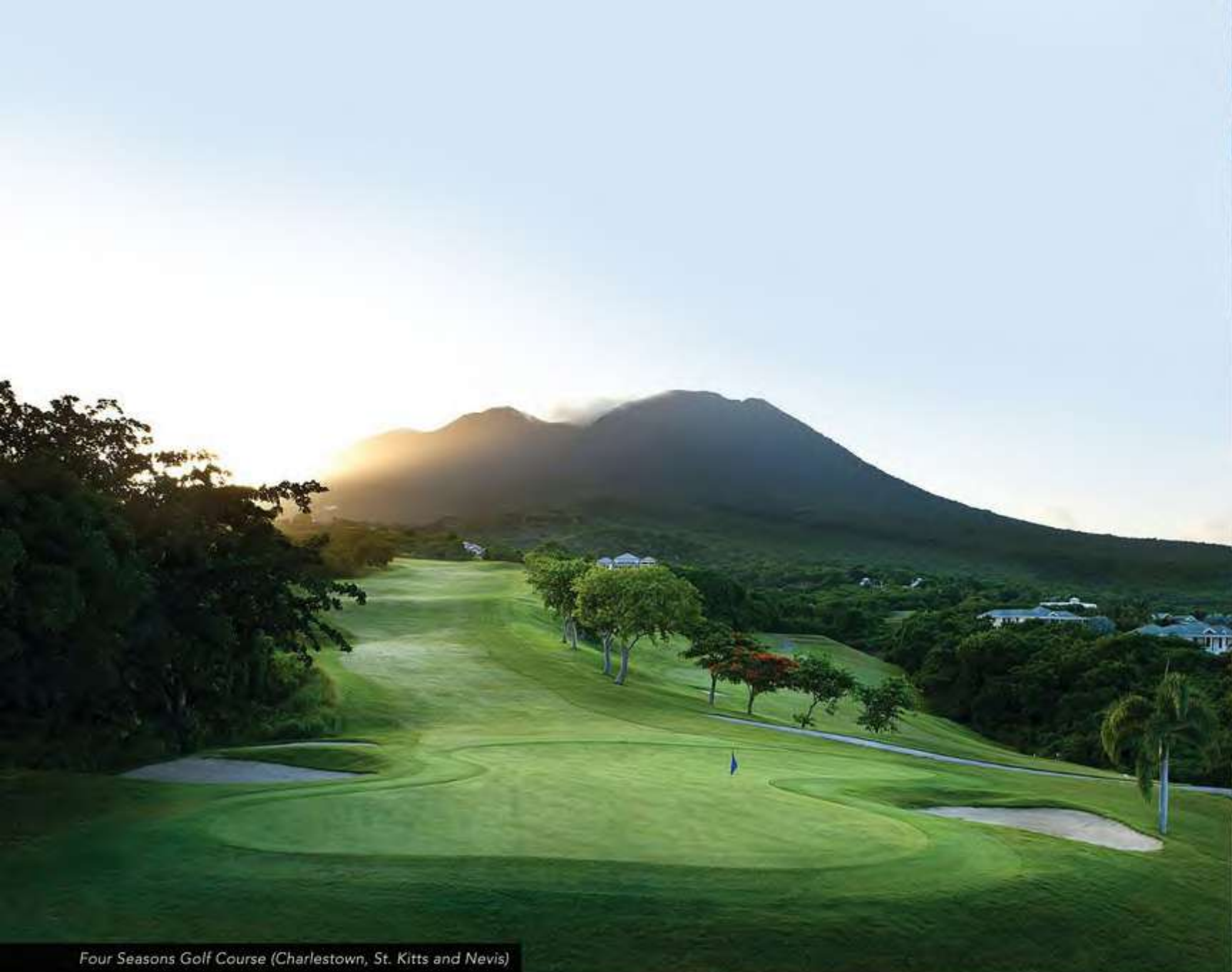
Four Seasons Golf Course (Charlestown, St. Kitts and Nevis)