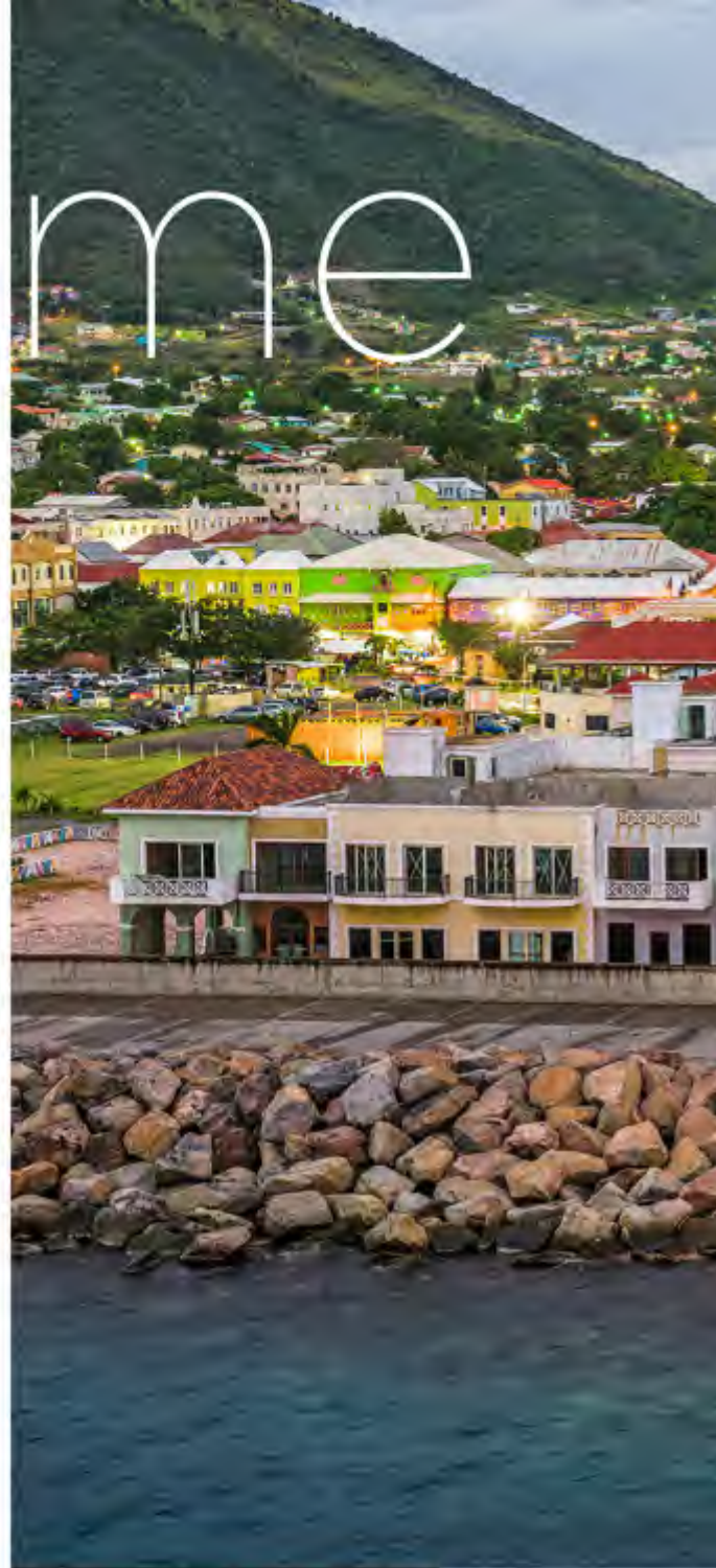
Brimstone Hill Fortress National Park

St Kitts and Nevis are considered to be the smallest nation in the Caribbean in both island size and population. While the islands were once part of the British Crown, today they are unitary islands forming a nation. St. Kitts and Nevis are very stable and secure. They have a bustling tourism industry and in many ways serve as a tax haven for some wealthy individuals and corporations.